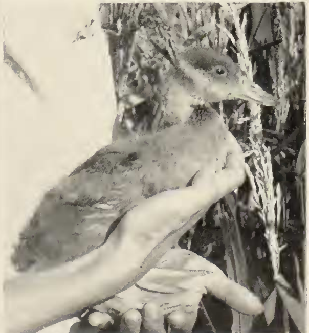
FIG. 5. Downy young four days old.